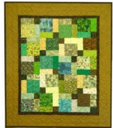
Sample Base Pattern

Registration: e-mail Ellen Mortimer at emort25@aol.com